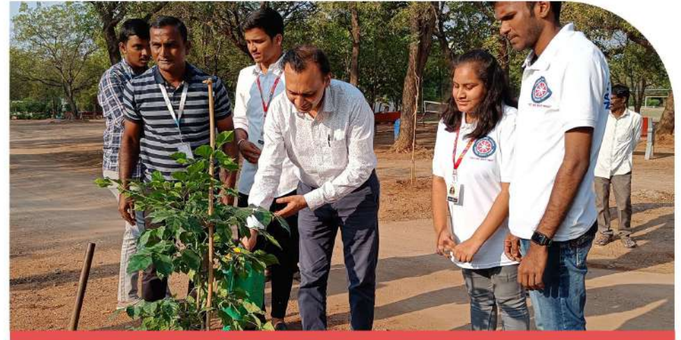
NCC (National Cadet Corp)