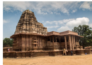
Ramappa Temple (UNESCO's World Heritage)