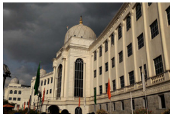
Salar Jung Museum