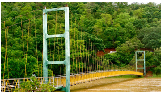
LAKNAWARAM LAKE, Warangal