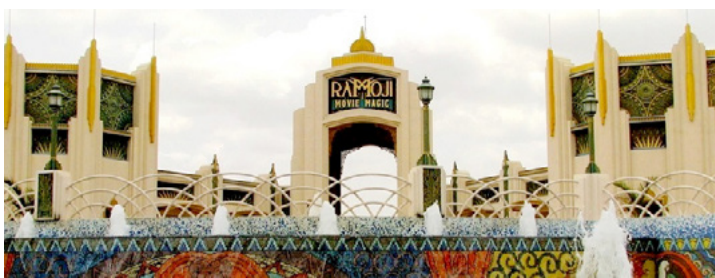
Ramoji Film City