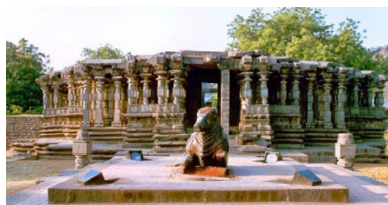
1000 PILLER TEMPLE, Warangal