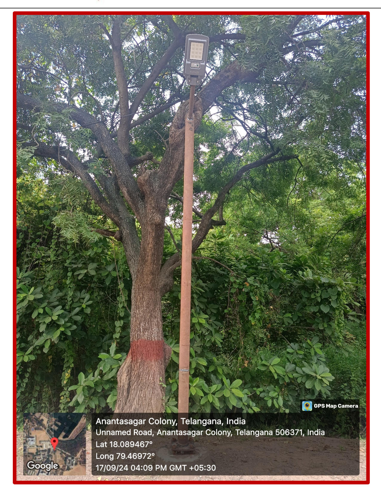
Sensor Based Solar Street Light