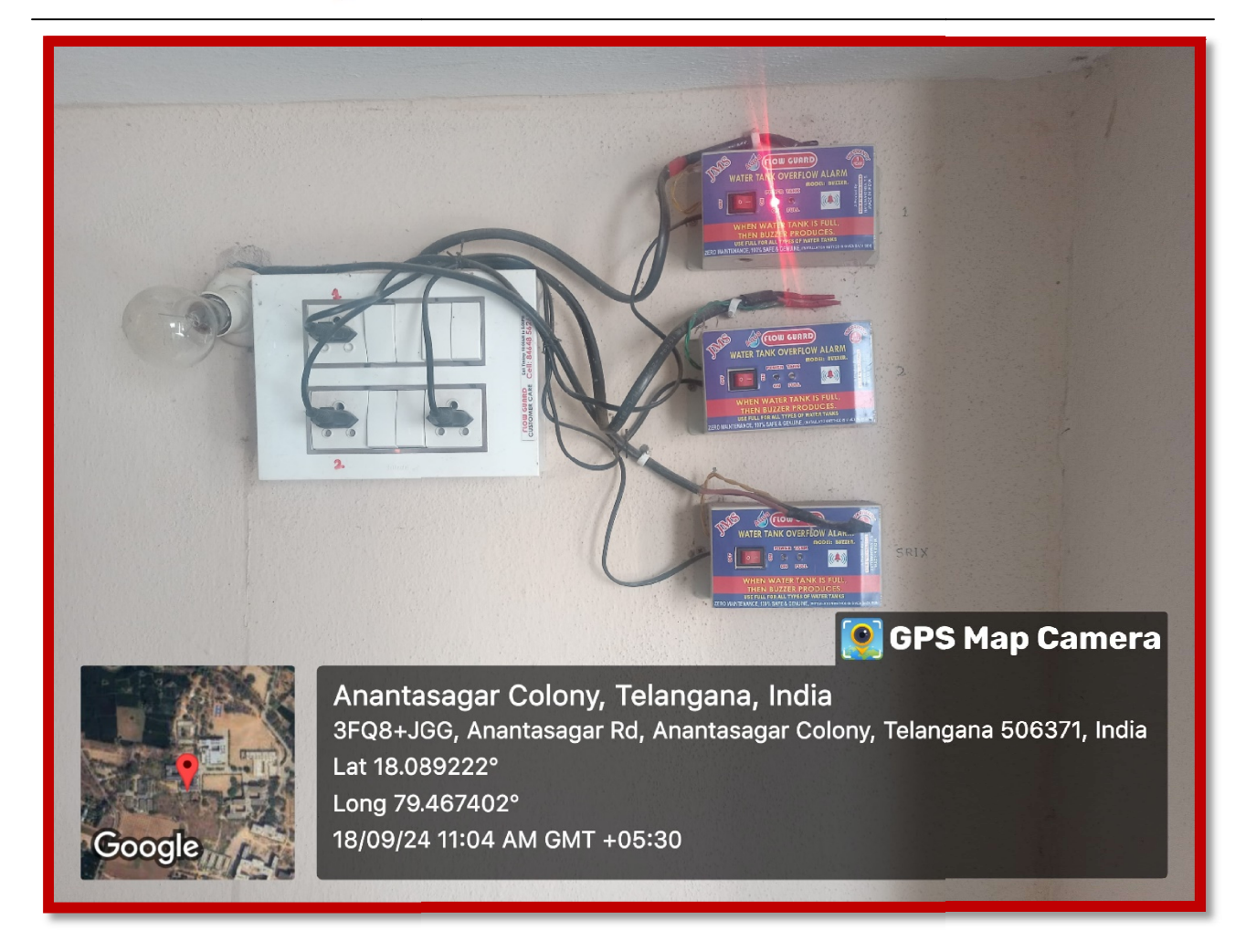
Sensor based Water tank Overflow Alarm