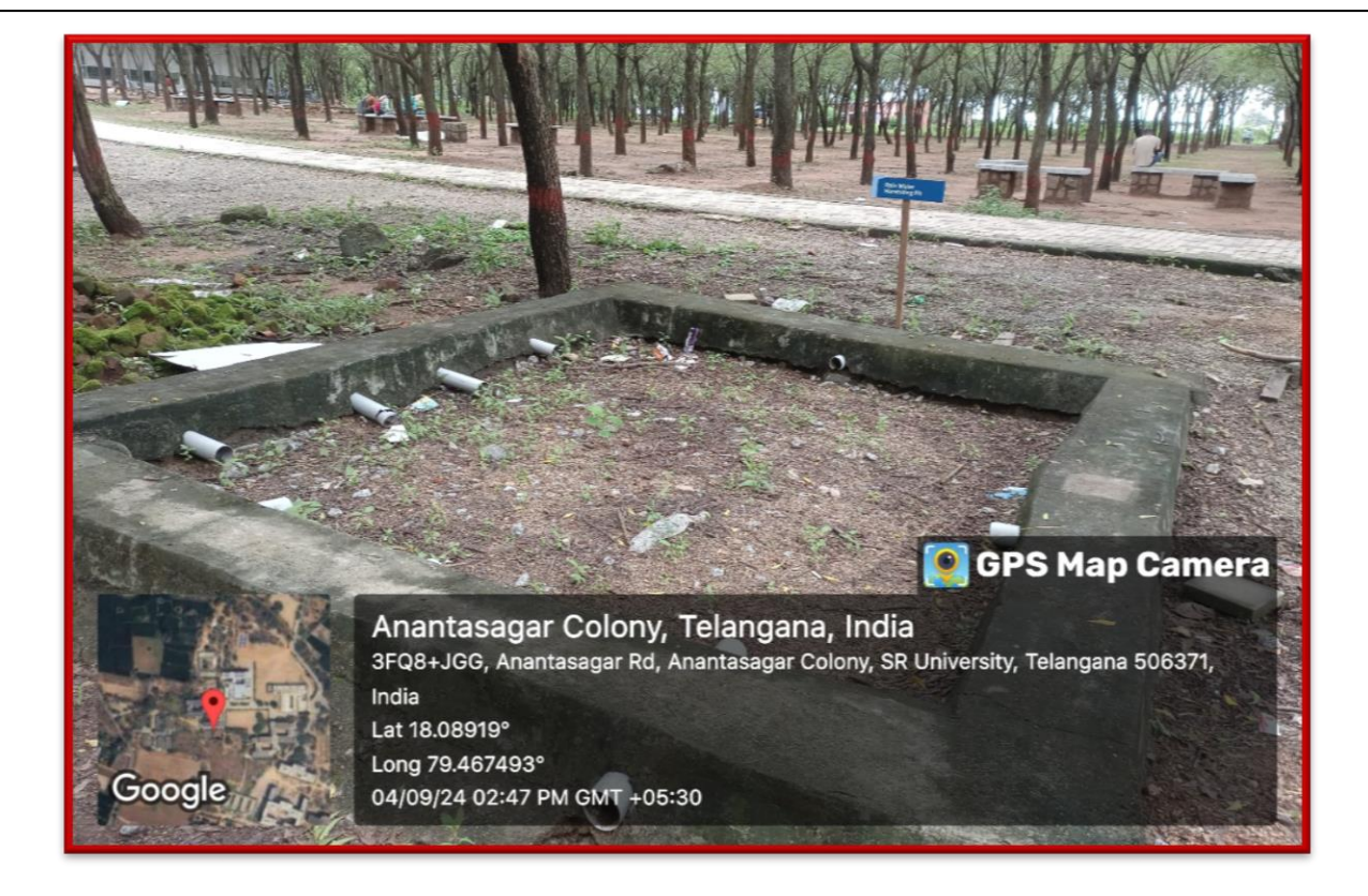
Rain Water Harvesting Pit: Block II South West Corner