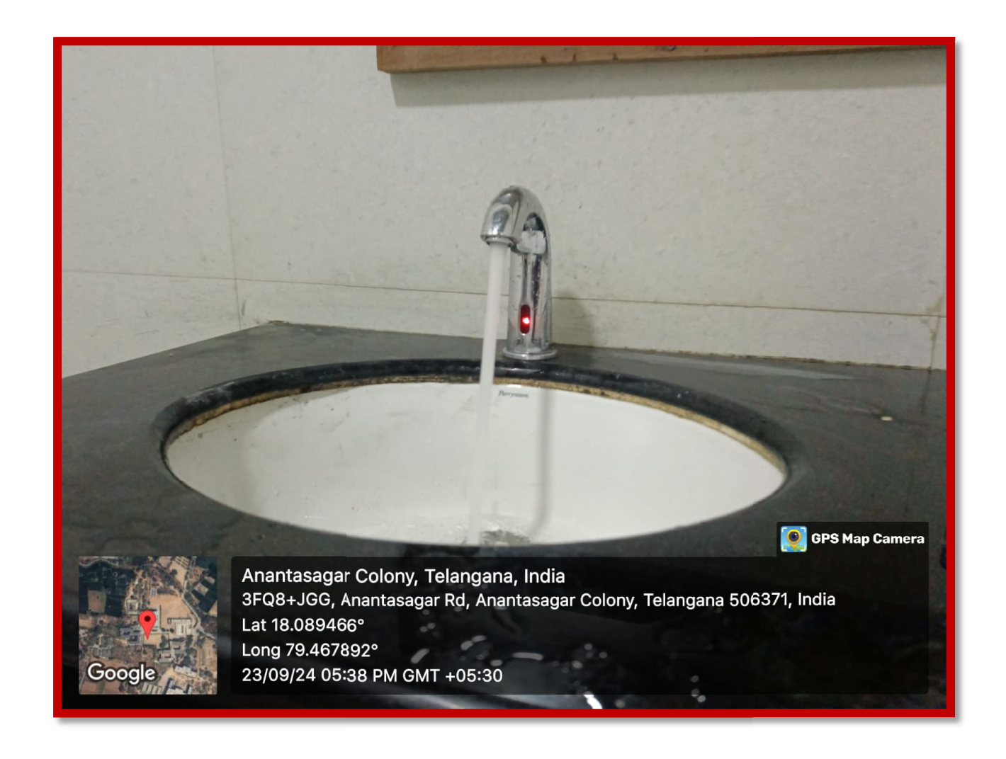
Sensor Based Water Tap