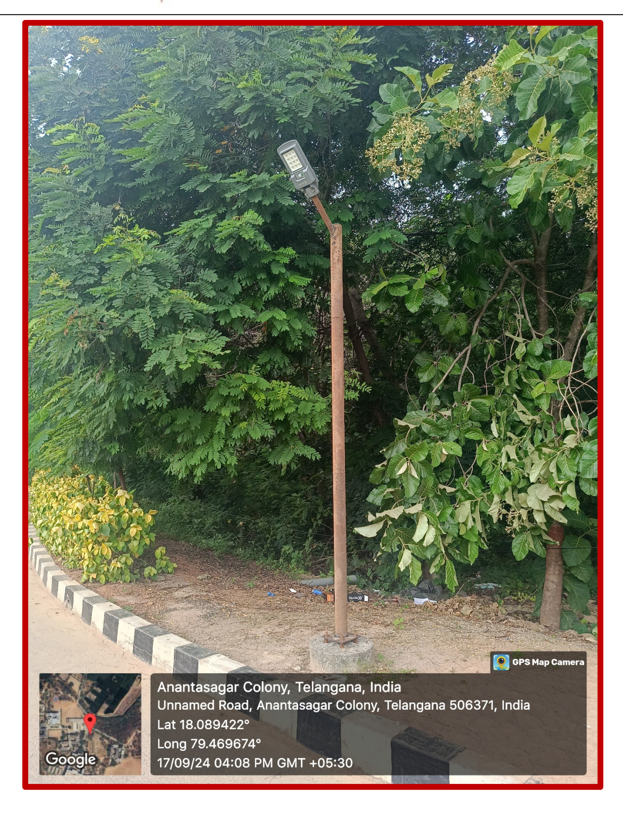
Sensor Based Solar Street Light